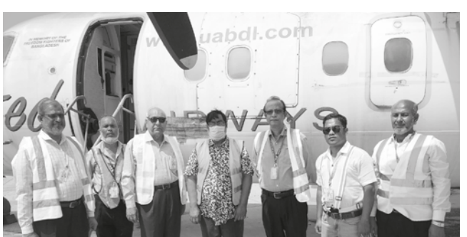
BOD's Inspecting Aircrafts at HSIA